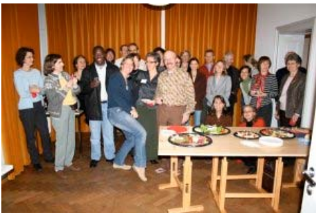
All participants at saying "cheese" at our New Year's apero