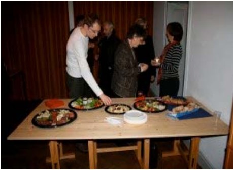
Our delicious apero plates were very popular...